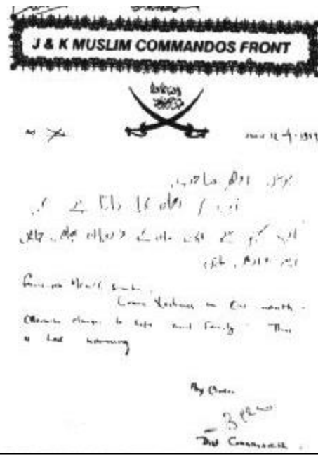
The terrorist's intimidation: Leave Kashmir in one month otherwise danger to life and family. This is Last Warning. - By Order District Commander